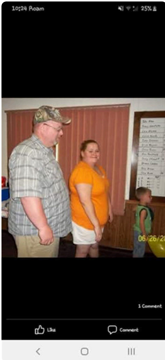
him and my game BF who is also my uncle his he was my dad's brother but him and my GMA got 2...