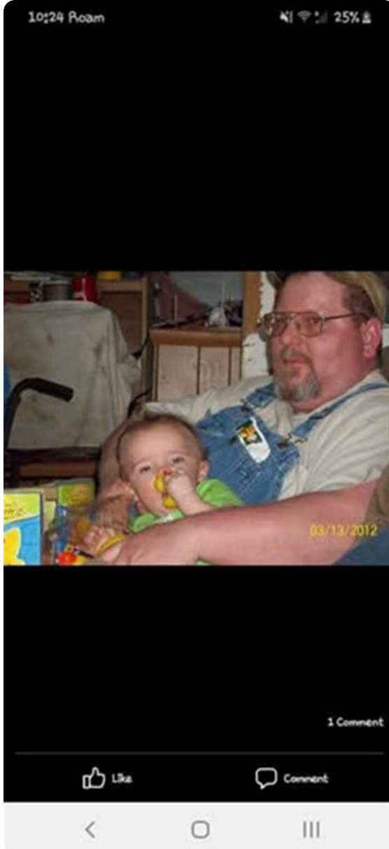
him and my game BF who is also my uncle his he was my dad's brother but him and my GMA got 2...