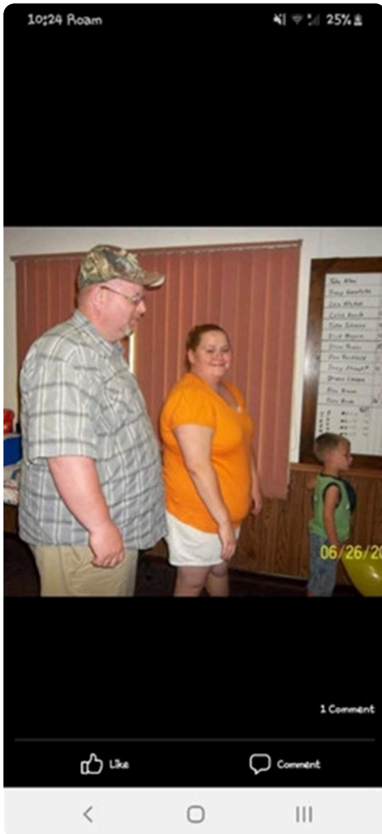
him and my game BF who is also my uncle his he was my dad's brother but him and my GMA got 2...