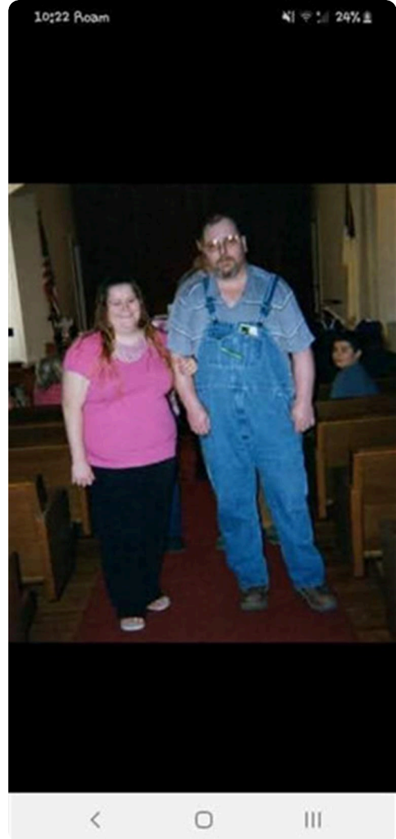
him and my game BF who is also my uncle his he was my dad's brother but him and my GMA got 2...