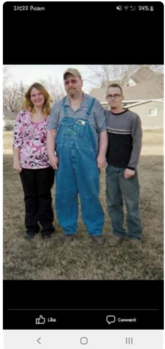
him and my game BF who is also my uncle his he was my dad's brother but him and my GMA got 2...