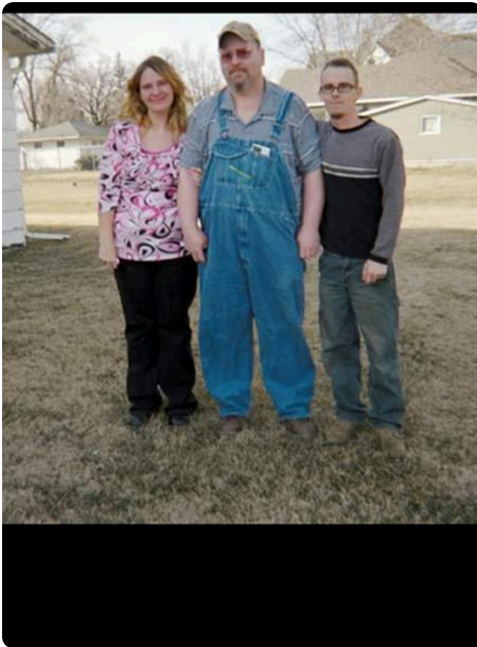
him and my game BF who is also my uncle his he was my dad's brother but him and my GMA got 2...