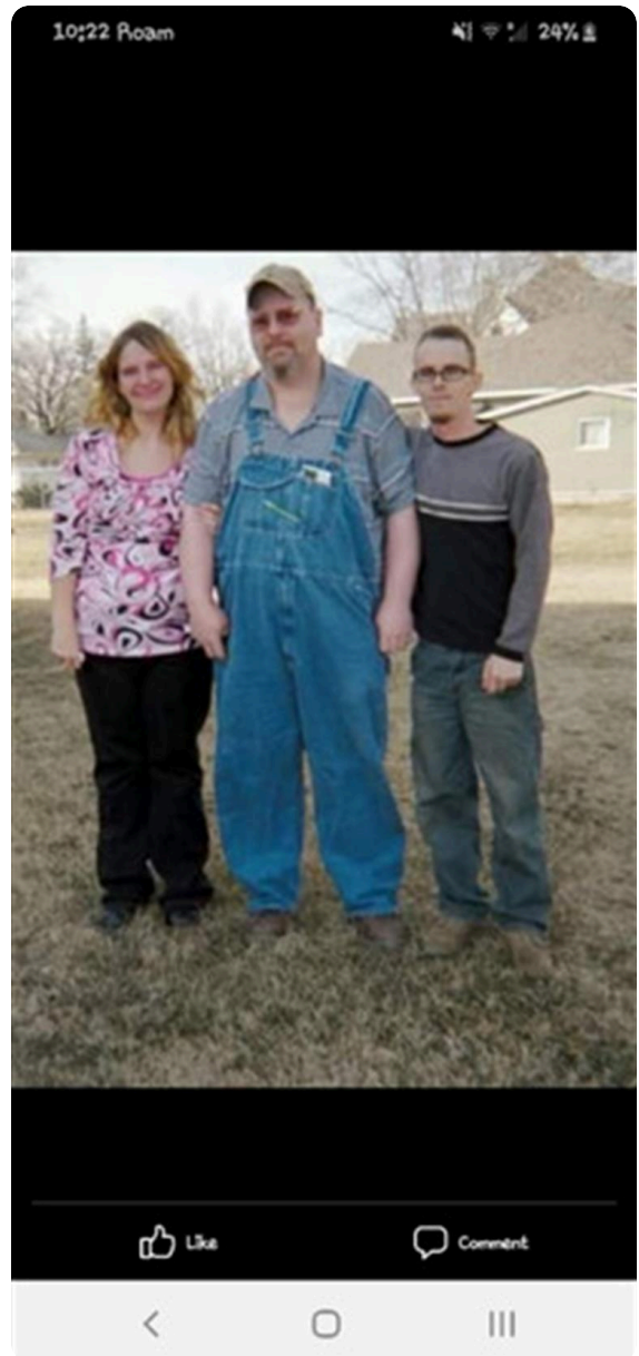
him and my game BF who is also my uncle his he was my dad's brother but him and my GMA got 2...